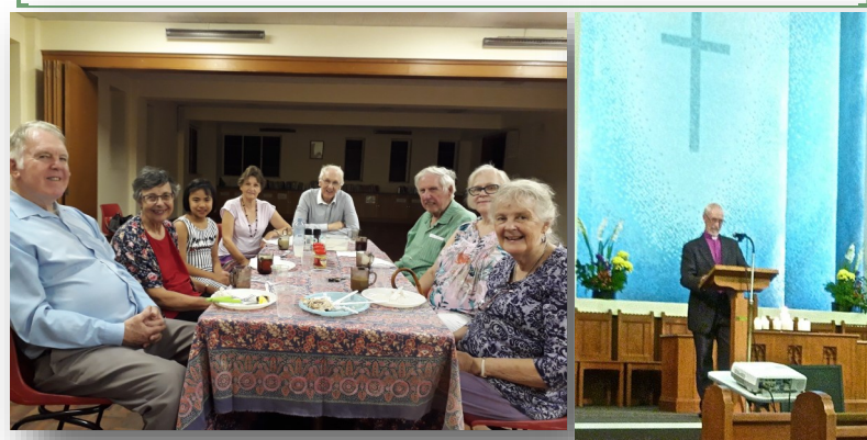
Our Lenten dinner which took place in the PMR Epping last Saturday 23rd March.